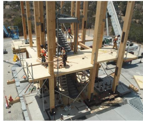
Left: Columns, stairs and temporary bracing; Middle: Level 1 beams and slabs; Right: Installation of Level 1 safety rails.